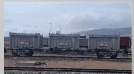
figure 4: Containers loaded off truck onto railcars heading for the port of Matarani