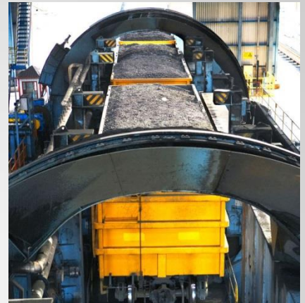
figure 1: traditional rotary rail car dumper

The MMG CBH system comprises of a bespoke bulk container used with a truck and rail bimodal transport solution from the mine to the port and a rotating spreader called the RAM Revolver® that lifts and tips the container's contents into hoppers at the rail transfer station, completing the export process. MMG awarded the trucking services to Transaltisa and the rail service to Peru Rail, both Peruvian companies.