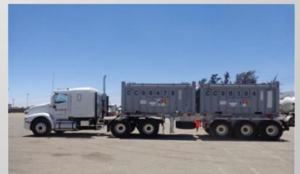
figure 3: Truck leaving port of Las Bambas heading to the Truck-to-Rail transfer station