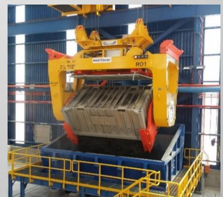
figure 6: Semi-automatic crane moves RAM revolver over to the hopper, lid is removed and container rotates 360 degrees