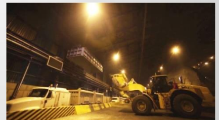
figure 2: Front end loader filling containers before sealing